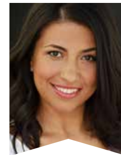
Actress Voice Actress VALENTINA LATYNA