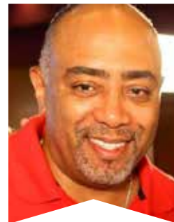
Voice Actor RODD HOUSTON