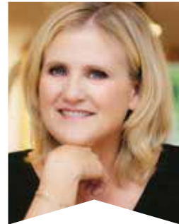
Voice of Bart NANCY CARTWRIGHT