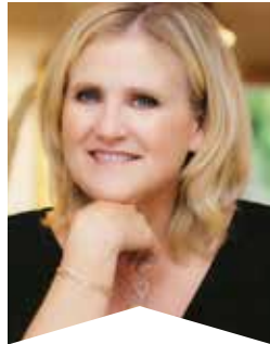
Actor/Producer/Philanthropist Voice of Bart Simpson NANCY CARTWRIGHT