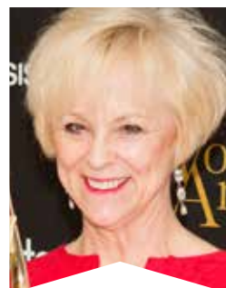
Voice Actor 5-Time Voice Arts® Winner DEBBE HIRATA