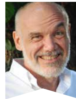
Audiobook Producer Full Cast Audio BRUCE COVILLE