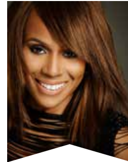
Grammy® Award Nominee Broadway Star DEBORAH COX