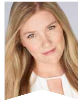
Voice Actress CHRISTIE CATE