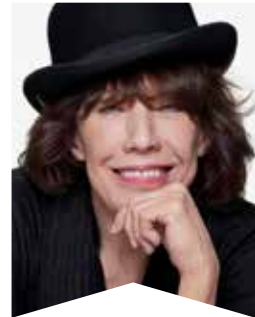
Performer/Activist LILY TOMLIN