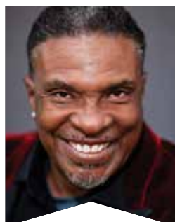
Actor 3-time Emmy Winner Voice Arts® Winner KEITH DAVID