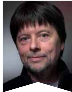
Filmmaker/Producer KEN BURNS