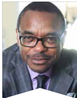
Senior Correspondent Inside Edition LES TRENT