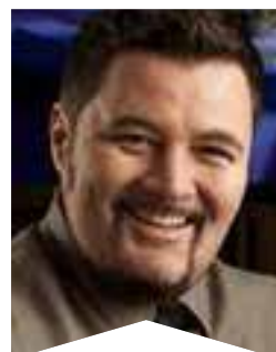
Producer SCOTT SHERRATT